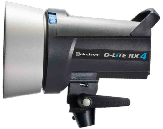
D-Lite RX 4 — 400 Ws — N° 20487.1