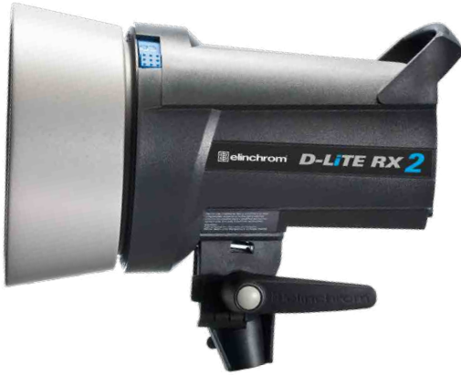
D-Lite RX 2 — 200 Ws — N° 20486.1