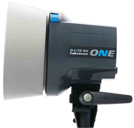
D-Lite RX ONE — 100 Ws — N° 20485.1